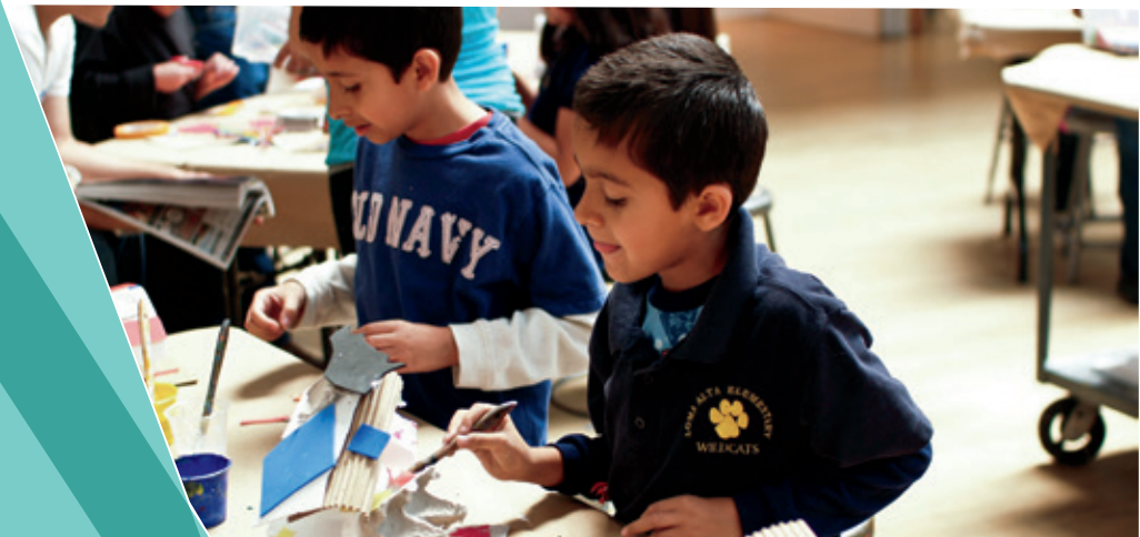
The Armory's New Visions Field Trip Program is made possible, in part, by generous support from The Alexander and Adelaide Hixon Donation to the Endowment for Teacher Training Scholarships; Pasadena Art Alliance; Capital Group Companies Charitable Foundation; the Armory Board of Directors; and individual contributions to The Armory Arts Education Fund.