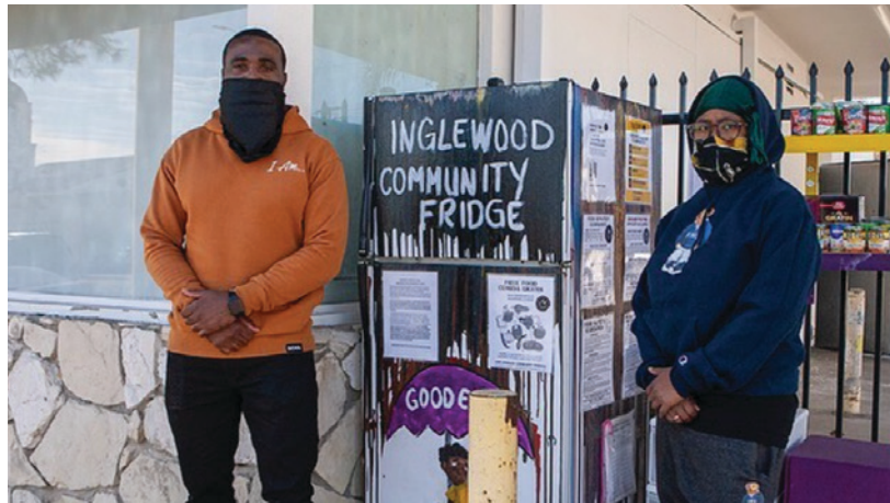
Inglewood Community Fridge, Champions feed Champions.